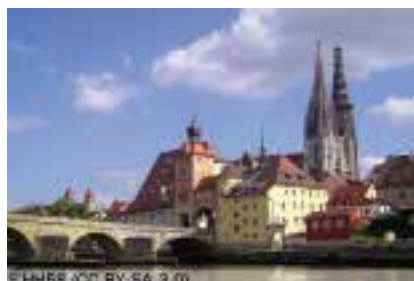
Regensburg Historic city on the Danube. It's old town is a UNESCO World Heritage Site.