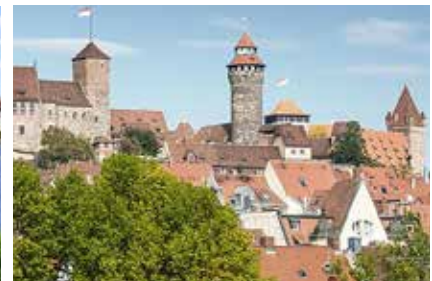
Nuremberg Bavaria's second largest city with a medieval castle and world-famous Christmas market.