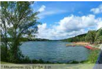
Franconian Lake District Beautiful region with many recreational opportunities such as water sports, beaches, boat trips, cycling and hiking.