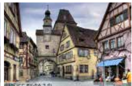
Rothenburg ob der Tauber A well-preserved historical city with medieval architecture and walkable city walls.