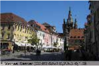
Ansbach Capital of the central Franconian district; organiser of Bach Festival week.