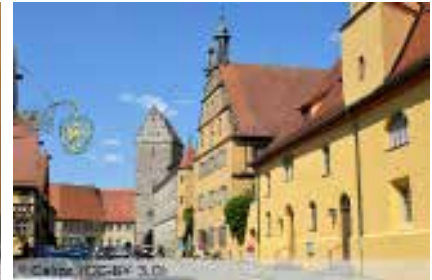
Dinkelsbühl A charming late medieval town with an annual festival.