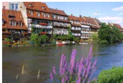
Bamberg Medieval world heritage city with numerous sights and baroque architecture.