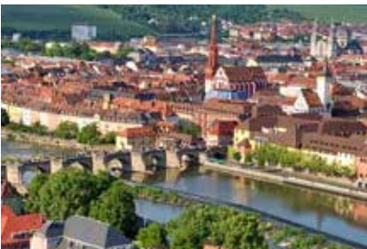
Würzburg Baroque town in the Franconian wine region in Bavaria. The residential palace is a UNESCO World Heritage Site.