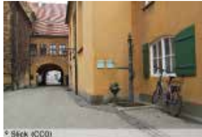
Augsburg One of the oldest cities in Germany and the third largest city in Bavaria.