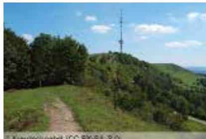
Hesselberg The Hesselberg is the highest elevation in Middle Franconia with a wonderful panoramic view from the summit.