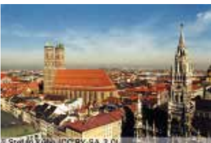
Munich Bavaria's state capital with many sights and opportunities for cultural and leisure activities.